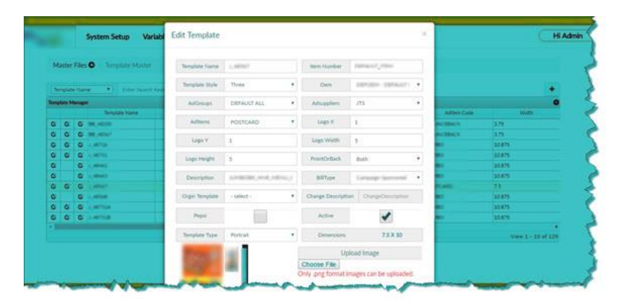
Screen1: Designing and Order placement