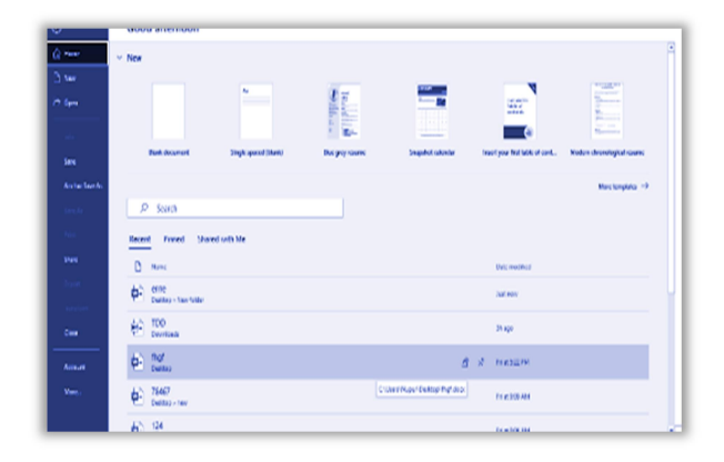
Screenshot 2: Protected Word File